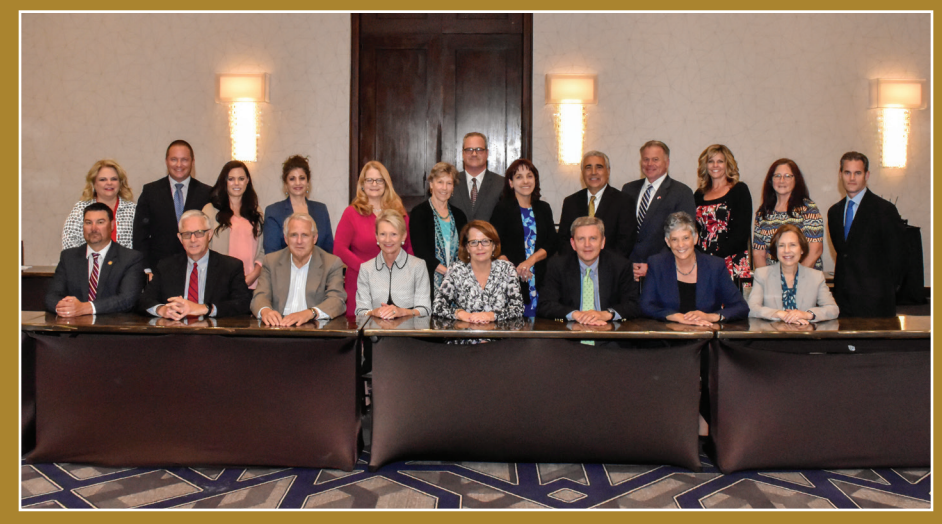
Members of the National Judicial Opioid Task Force convened in Indianapolis in June 2018. The Task Force includes representatives from 24 states, most of whom are pictured above.